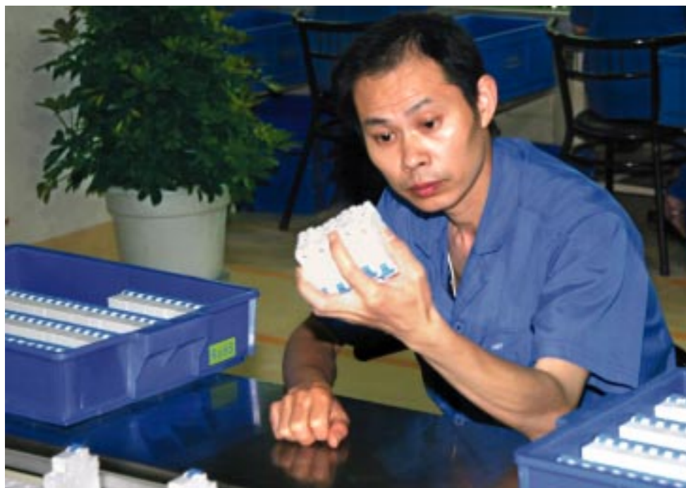
Just before boxing, final inspection of electrical switches on a CHINT production line.