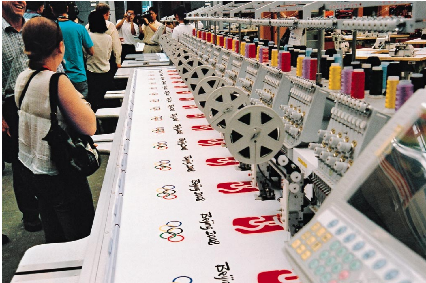
In Taizhou City, Zhejiang Province, stitching the logo for the 2008 Beijing Olympic Games to come at Feiyue, a major manufacturer of industrial and consumer sewing machinery with operations worldwide.