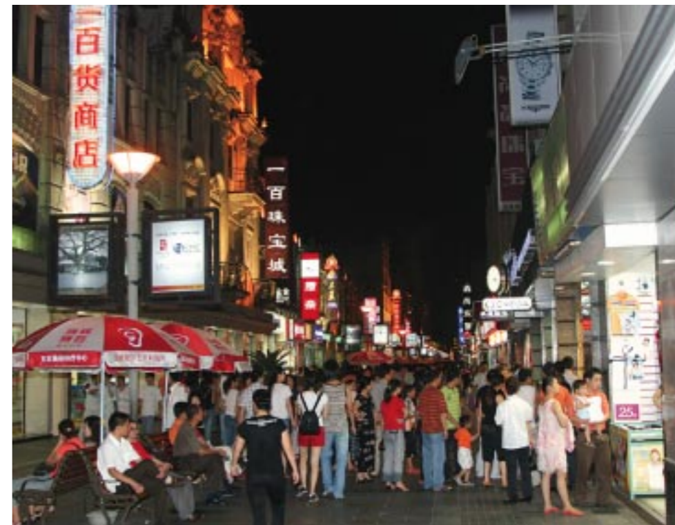
Wuma Walking Street, Wenzhou, Zhejiang Province.