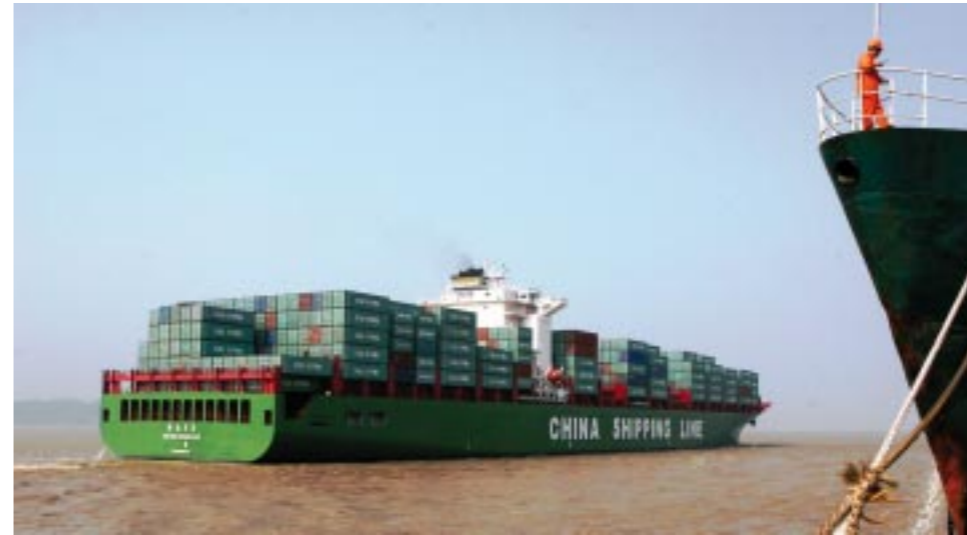
Outbound-Goods ship out of the massive Ningbo Port, Zhejiang Province.

A notable portion of Zhejiang's growth is attributed to a market that is extraordinarily receptive to foreign-based firms. Today more than 2,200 foreign enterprises operate within Zhejiang's borders. That's more foreign-owned enterprises than any other province in China. The province maintains eco-