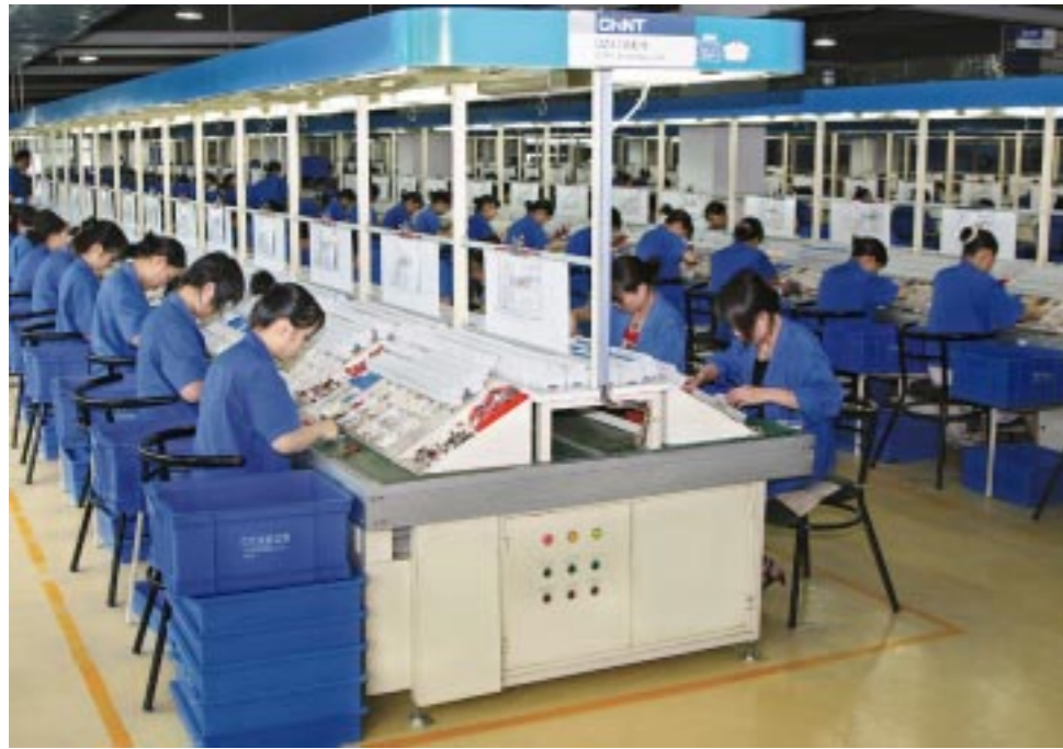
At CHINT, where the stated company policy is to operate with a "humanistic" approach, workers are fast at it. Assembling a variety of electrical mechanical devices within a huge air-conditioned production facility, they are paid by the piece, and typically earn between 1,500 to 2,500 yuan a month, well above the regional average. Work days run about eight hours, with one break plus lunch. CHINT maintains their health and welfare insurance, and dormitories and commissaries provide housing and meals as part of the deal. by Lowell Bennett

At the close of 2005, the level of international import/export trade volume in and out of China's southeastern coastal province of Zhejiang topped $107 billion, one of only four provinces to hit this mark. By all accounts this benchmark was achieved through progressive policies that have realized a lucrative level of regional prosperity, ongoing openness to foreign enterprise, greater gains for a better educated citizenry, and more cautious care for the environment.