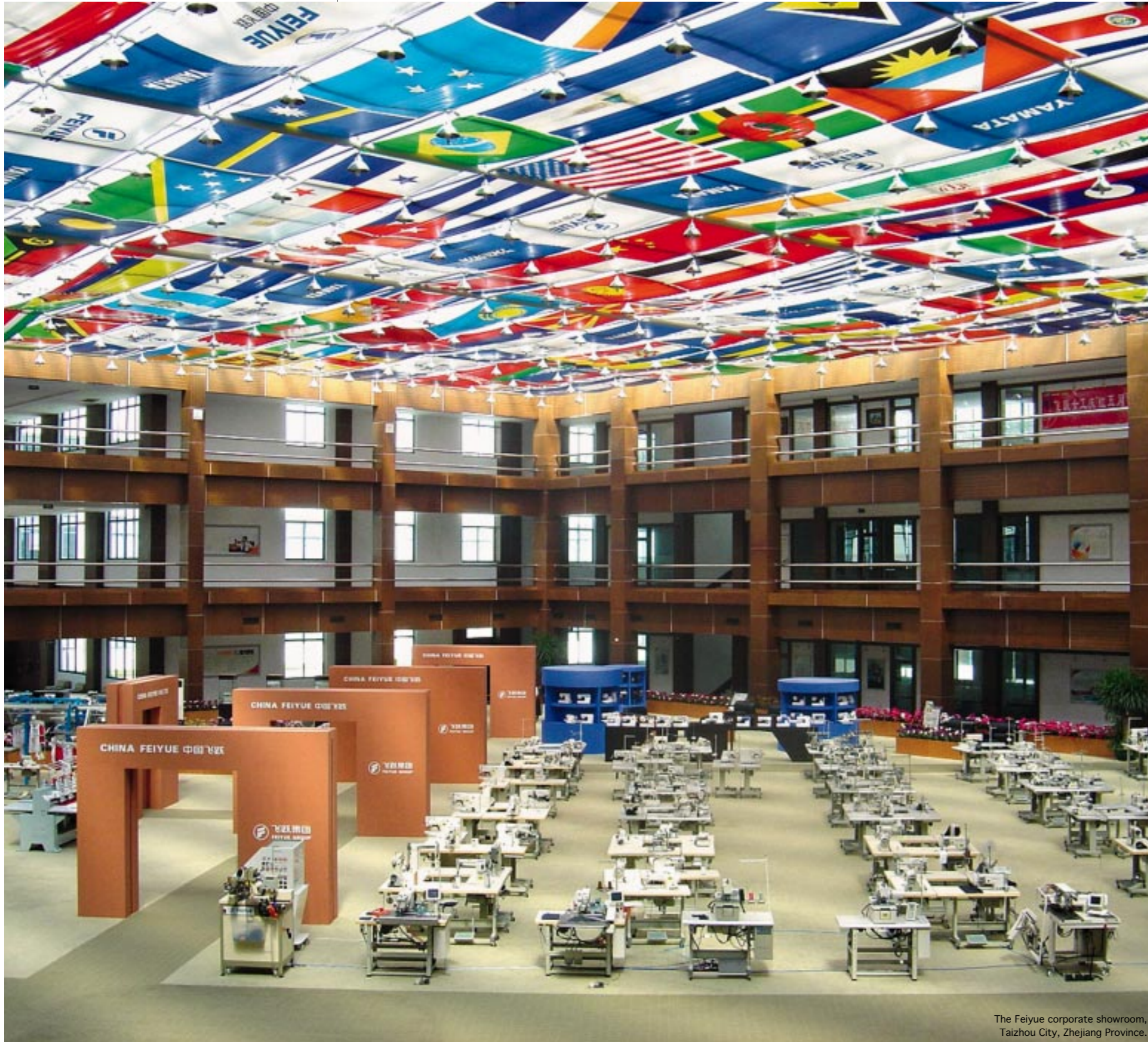
The Feiyue corporate showroom, Taizhou City, Zhejiang Province.